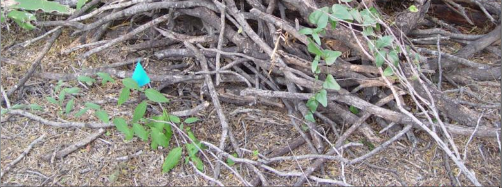
Tournefortia volubilis , Googly-Eye Vine, PDST p150 (left) and Snailseed Vine PDST p322 (right) have been planted near this small brush pile. Hopefully they will use it as a support.

In many “natural areas” where this attitude is held, one finds concrete structures resembling logs, or metal benches resembling limbs. “Fake Nature” sells very well; just check out the garden section of any store. Why mimic nature? Use the real thing!