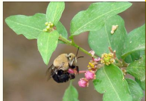
PHOTO: Bee on Barbados Cherry.