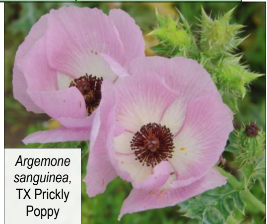
Argemone sanguinea , TX Prickly Poppy