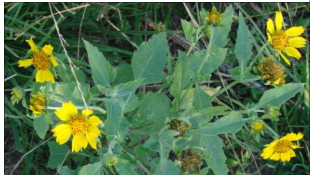
Above: Cow Pen Daisy, Verbesina encelioides , is easily established from wild-collected seed, but it may out-compete other natives. Tolerant of poor soils. PSDT p. 134 . No photo: Helianthus annuus PDST p. 105 , Common Sunflower is prolific in many farm fields. Easily established, it requires a bit more space.