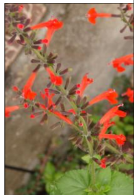
Right: Scarlet Sage, Salvia coccinea , PDST p. 288 . Produces brilliant blooms throughout the year in a wide variety of soils. Good nectar plant for hummingbirds and butterflies.