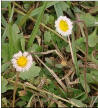
Left: Prostrate Fleabane, Erigeron procumbens . PDST p. 97

Early Wildflowers —Wildflowers are not abundant in January, but some species perform well, especially where they receive adequate sun and moisture. These species were photographed on South Padre Island, in Ramsey Nature Park in Harlingen, and at my home.